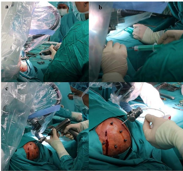
Figure 3. Frameless stereotactic brain biopsy and external ventricular drainage placement using the RONNA G4 system. (A) Using RONNA, skin perforation and twist drilling with a 4.5-mm drill and electrocoagulation of dura is done, as described in Dłaka et al. 2021. for frameless stereotactic brain biopsy, (B) obtaining tumor tissue for pathohistological analysis [7, 8]. Afterwards, the robot changed position to obtain proper position for EVD placement. (C) After skin perforation, twist drilling, and electrocoagulation, (D) an EVD catheter was placed in right lateral ventricle and clear cerebrospinal fluid was obtained under elevated pressure.

on first pass, a catheter placement using number of robot-assisted systems was done [1, 2, 4–6, 11]. Moreover, some authors design a prototype of the robotic navigation system to allow surgeons who do not have explicit neurosurgical training to place EVDs [9].