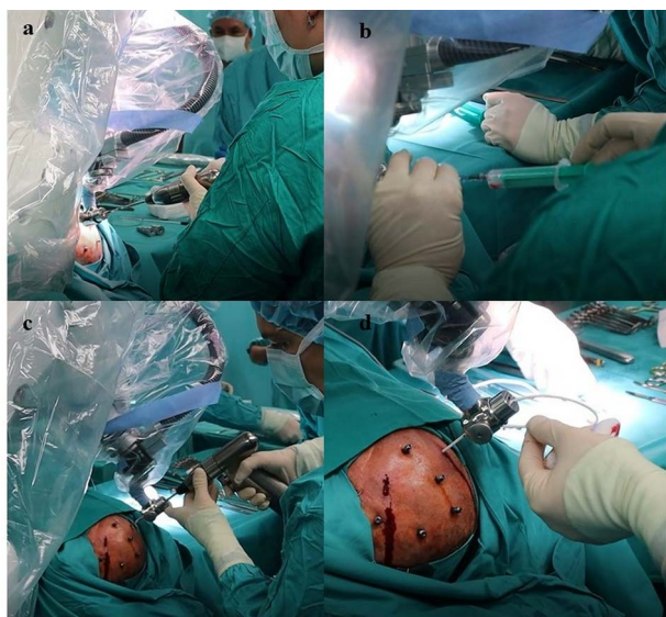
Figure 3. Frameless stereotactic brain biopsy and external ventricular drainage placement using the RONNA G4 system. (A) Using RONNA, skin perforation and twist drilling with a 4.5-mm drill and electrocoagulation of dura is done, as described in Dlaka et al. 2021. for frameless stereotactic brain biopsy, (B) obtaining tumor tissue for pathohistological analysis [7, 8]. Afterwards, the robot changed position to obtain proper position for EVD placement. (C) After skin perforation, twist drilling, and electrocoagulation, (D) an EVD catheter was placed in right lateral ventricle and clear cerebrospinal fluid was obtained under elevated pressure.

on first pass, a catheter placement using number of robot-assisted systems was done [1, 2, 4–6, 11]. Moreover, some authors design a prototype of the robotic navigation system to allow surgeons who do not have explicit neurosurgical training to place EVDs [9].