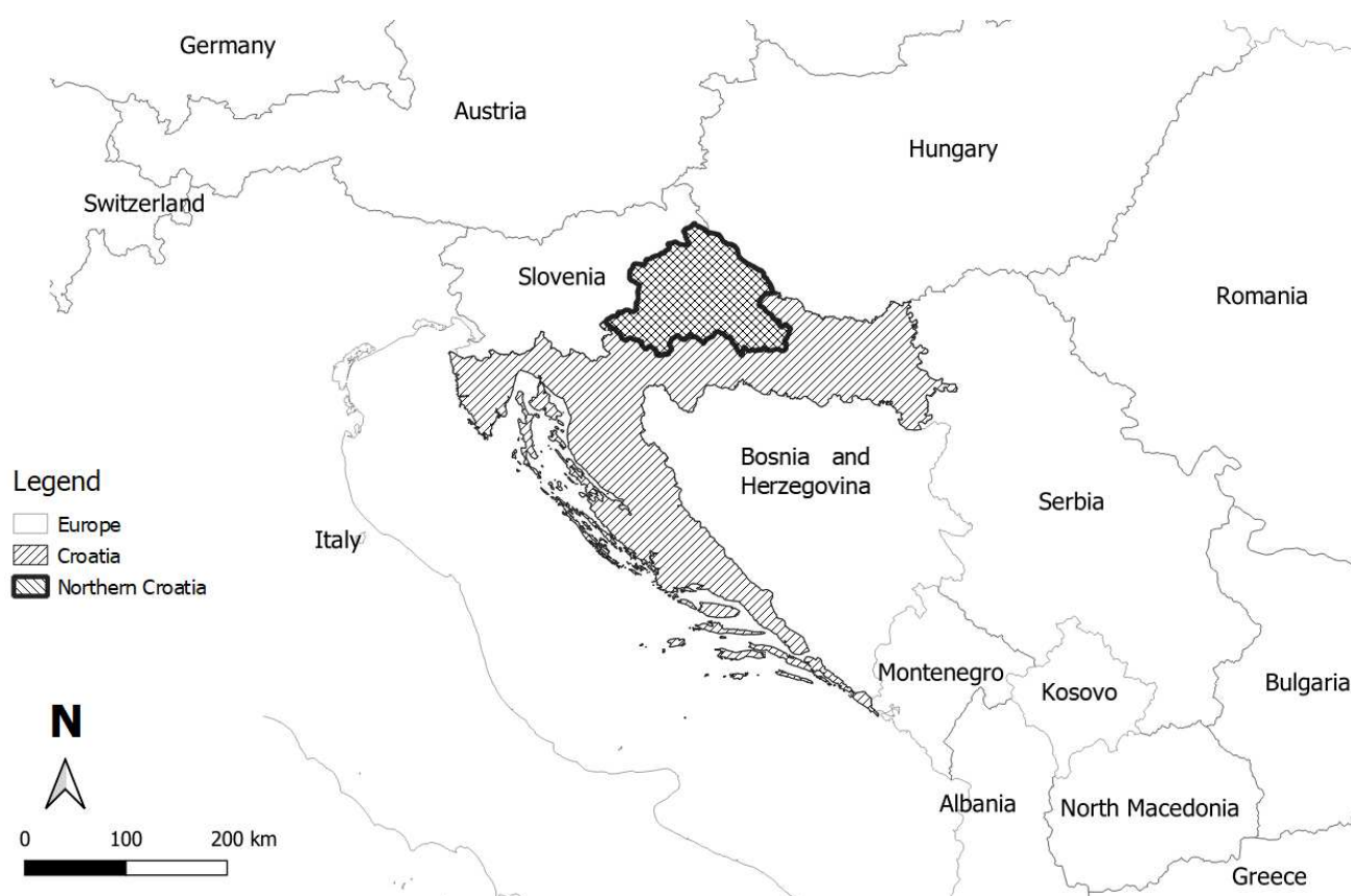
Figure 1. Case study—Northern Croatia.

The region of Northern Croatia [47] was selected for the case study and is shown in Figure 1.